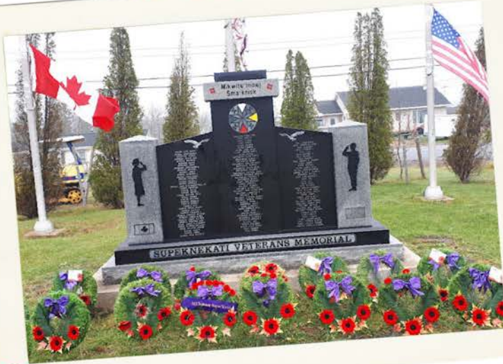
Sipekne'katik Cenotaph | 601 Church Street