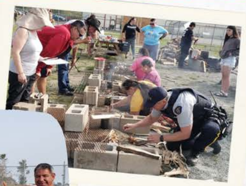
Community members tried their luck at a variety of competitions in the O'L PA'SN Games, including: Tea Boiling, Four Cents making, Waltes, and Cribbage.